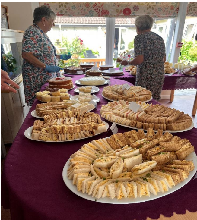
We made sure that we catered for different nutritional needs. Gluten Free was a request from families.